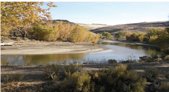
Near the Carson River ford.

Viewed from the direction the emigrants were approaching, the bluff hides behind other ridges until you are past it. However, looking back, it looms powerfully against the sky. This makes one wonder how something so imposing came to be known as "Susan's Bluff?" continued on page 4