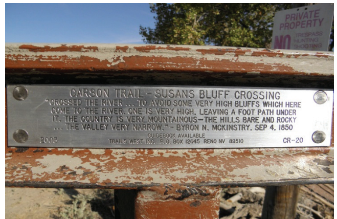
New Trails West Marker, CR-20 at Susan's Bluff.

Although not as popular as the faster Twenty-Six Mile Desert cutoff, which ran roughly where U.S. Highway 50 goes today, the Carson River route provided valuable feed and water for the stock pioneers still had. Along this route the wagon trains hugged the left bank of the Carson until they reached a steep bluff jutting out almost to the river. Although foot traffic could make it around the point of the bluff, wagons had to ford the river before they reached it. Trails West recently installed the last Carson Route marker, Marker CR-20, near this ford at the base of the cliff known as Susan's Bluff.