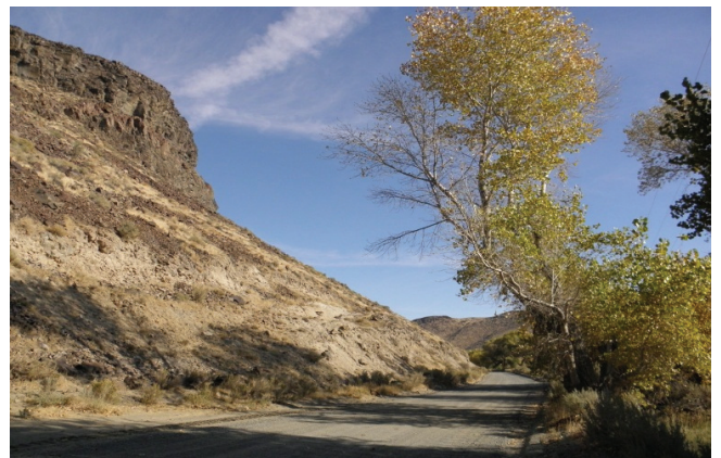
Looking back at Susan's bluff.